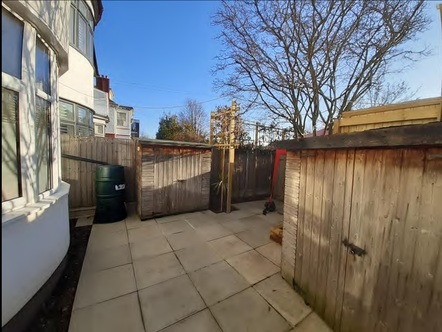
Enclosed area. Sheds are used for storage of prams, maintenance equipment and paraphernalia associated with nursery. Constr. Manager advised that outbuildings have been on the front part of the site historically.