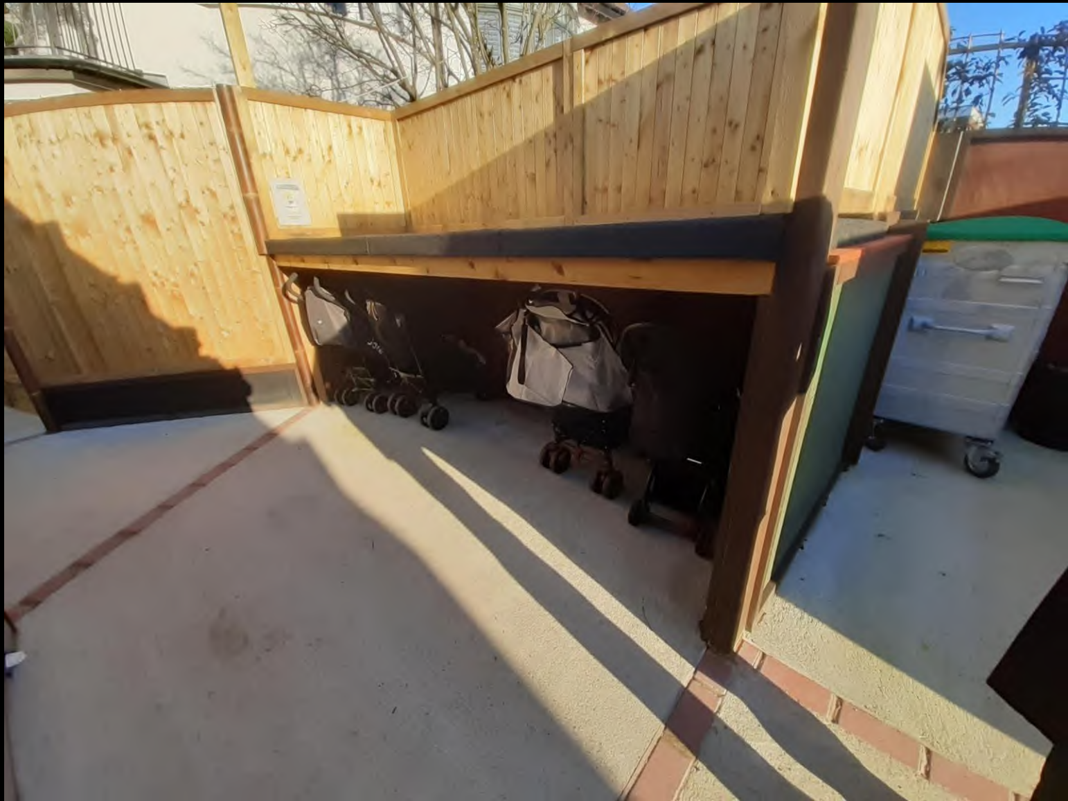
Pram storage area. Fences up to 2.22m