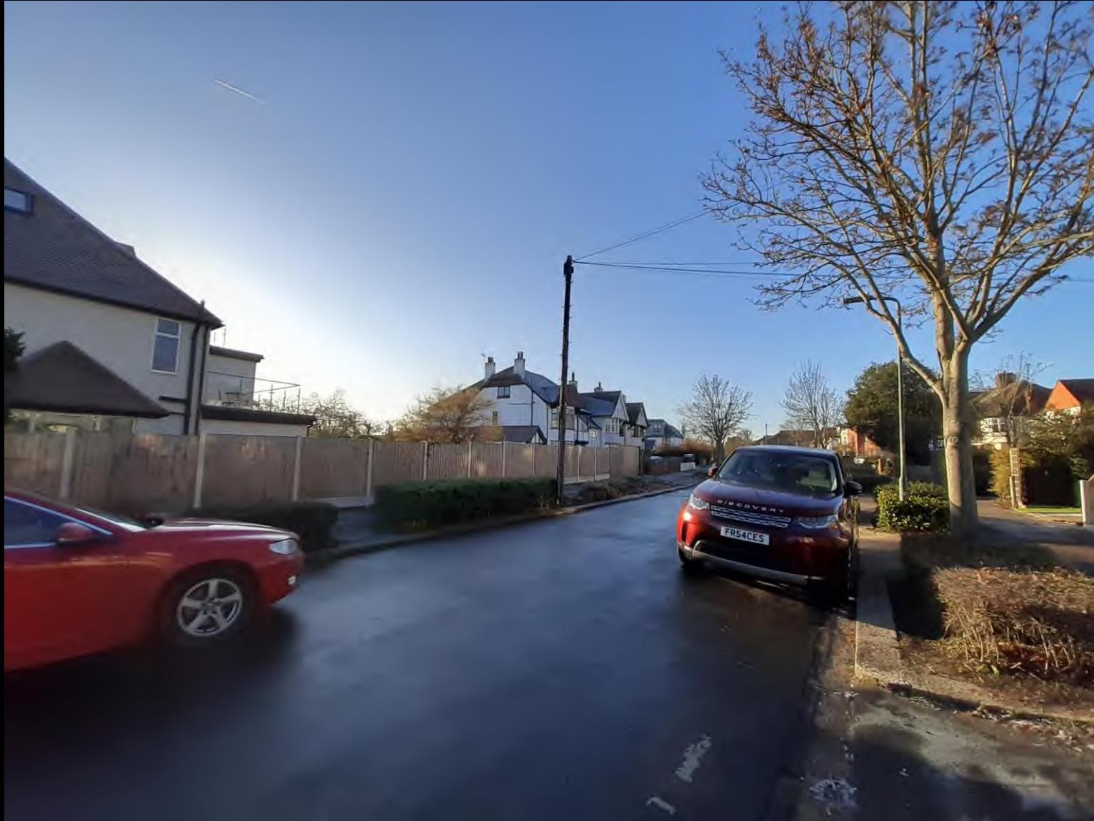
View of the area towards the west of the site