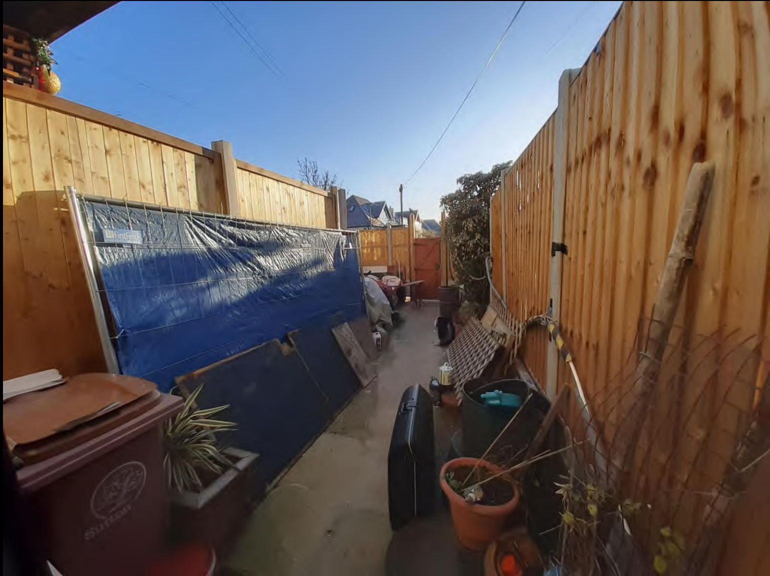
View of the area in front of the access point for the maisonette