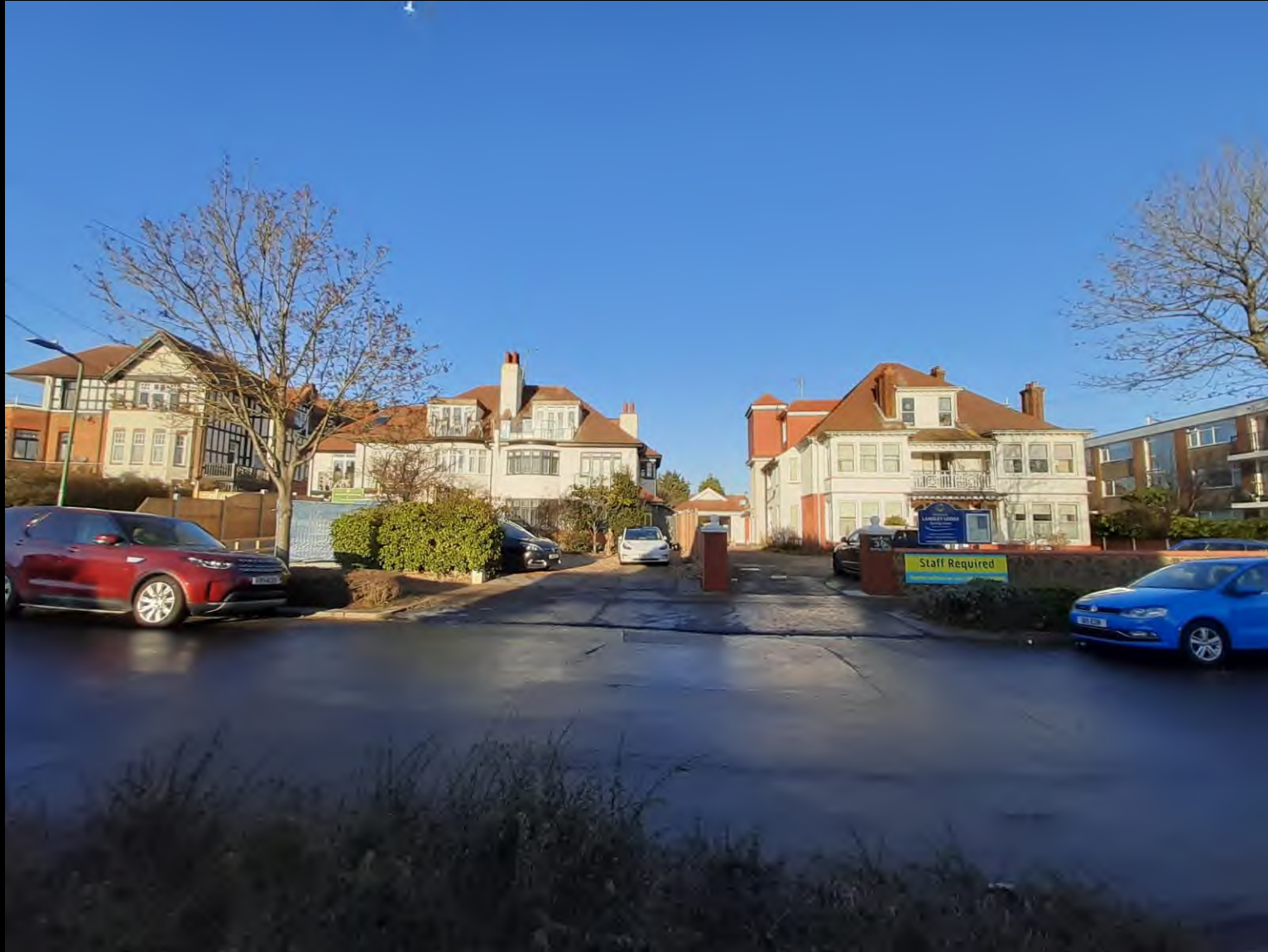
View of the site and neighbouring sites to the east from across the road.