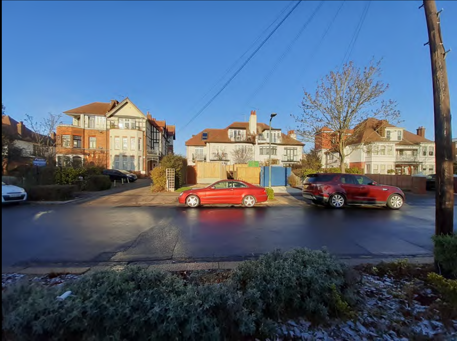
View of the site from across the road