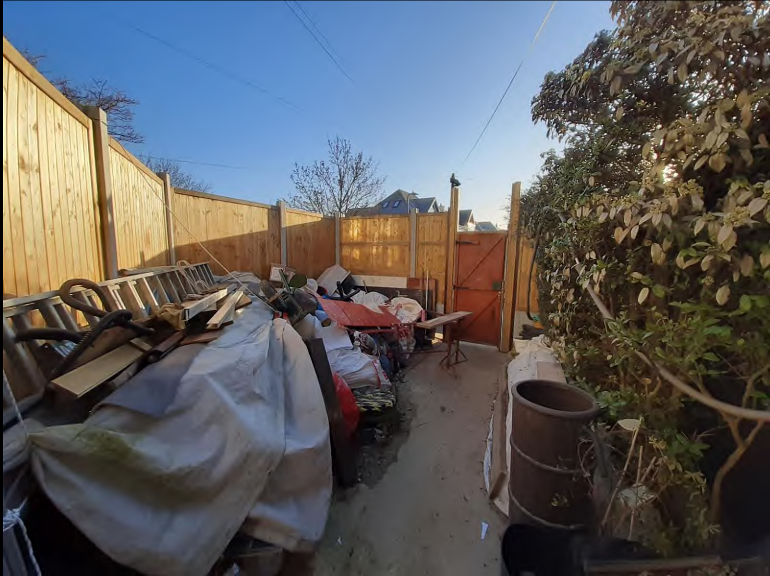
View of the area in front of the access point for the maisonette