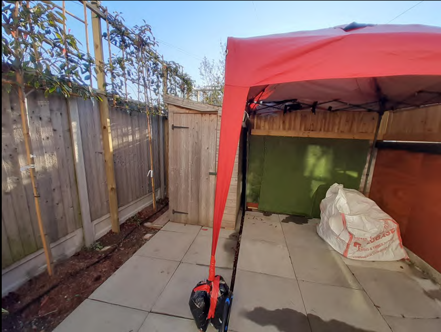
Side boundary fence slightly less than 2m in height. Structures supporting planting 3m high.