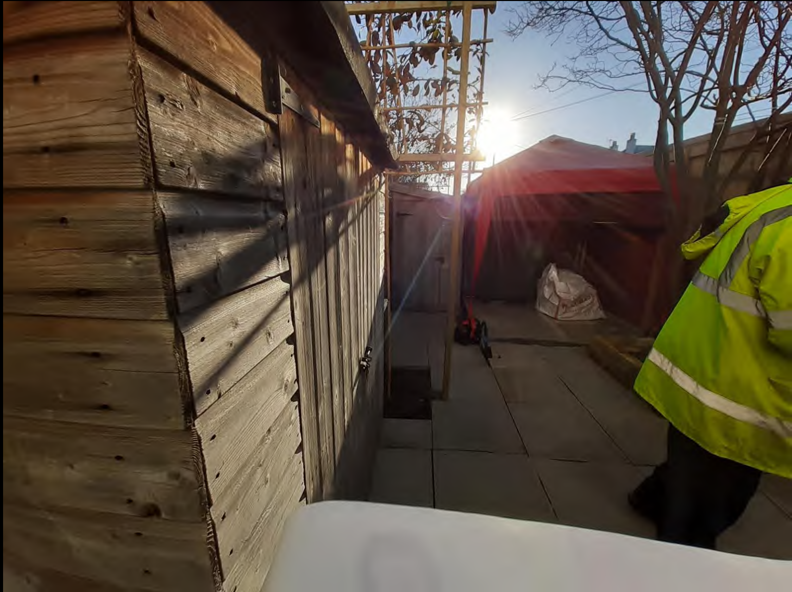
Additional shed and covered area with chattel cover. Used for storage similarly to the other two sheds.