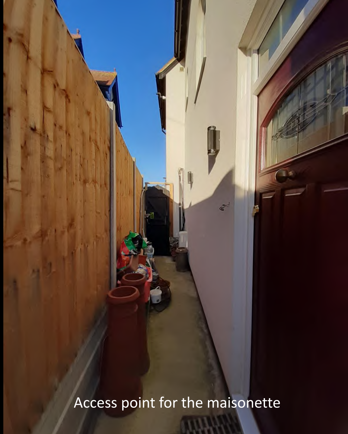
Access point for the maisonette