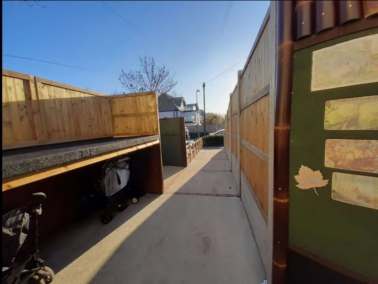
View of the site towards Imperial Ave