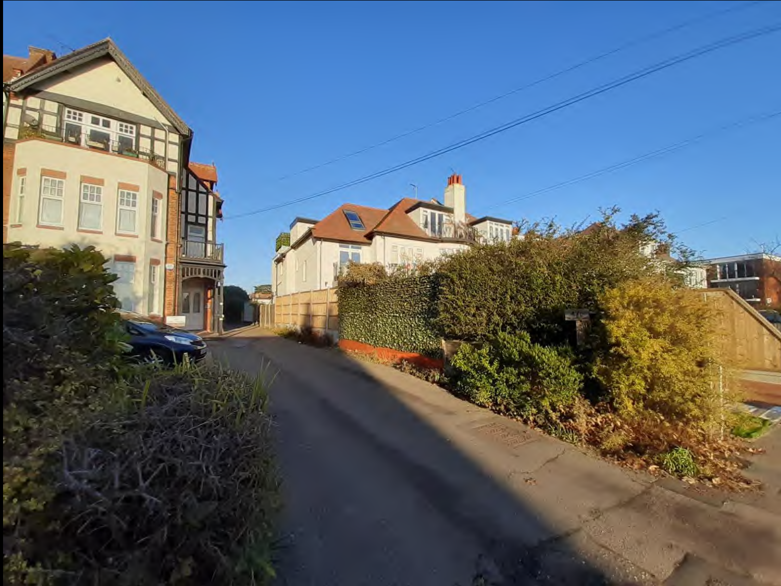
View of the site from frontage of neighbouring site to the west