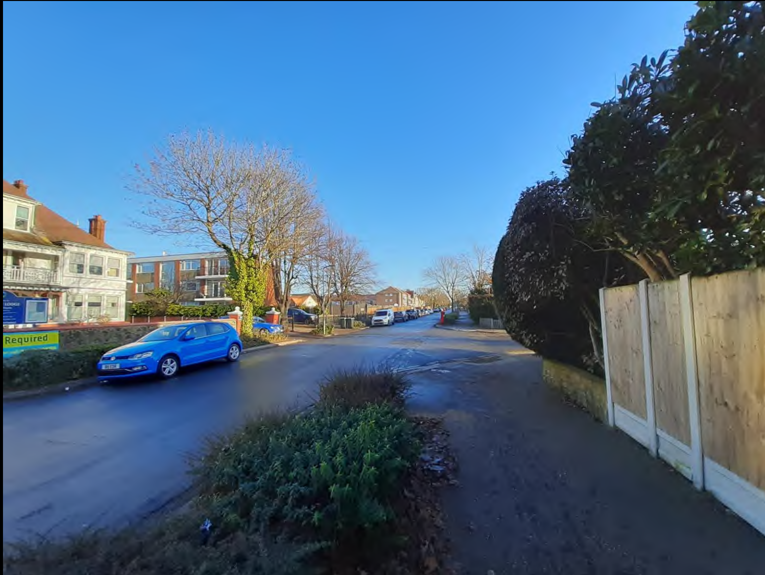
View of the area towards the east of the site