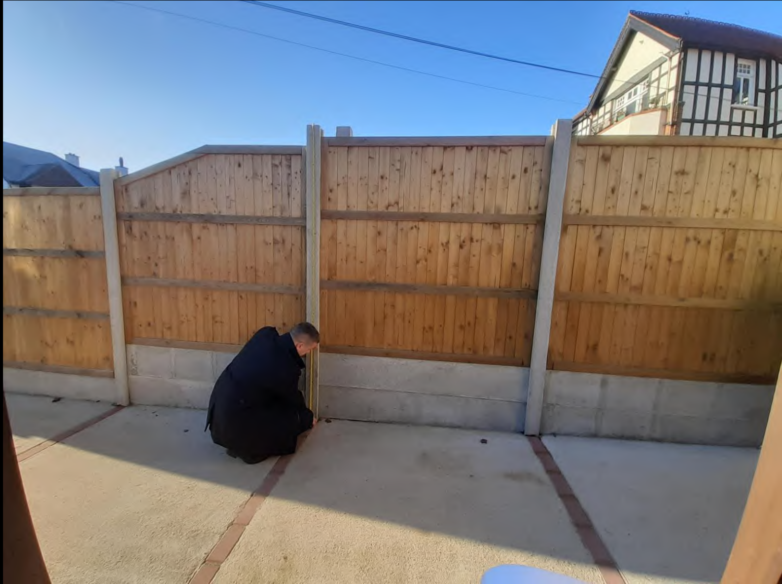
Fence in the middle of the site, 2.5m high.