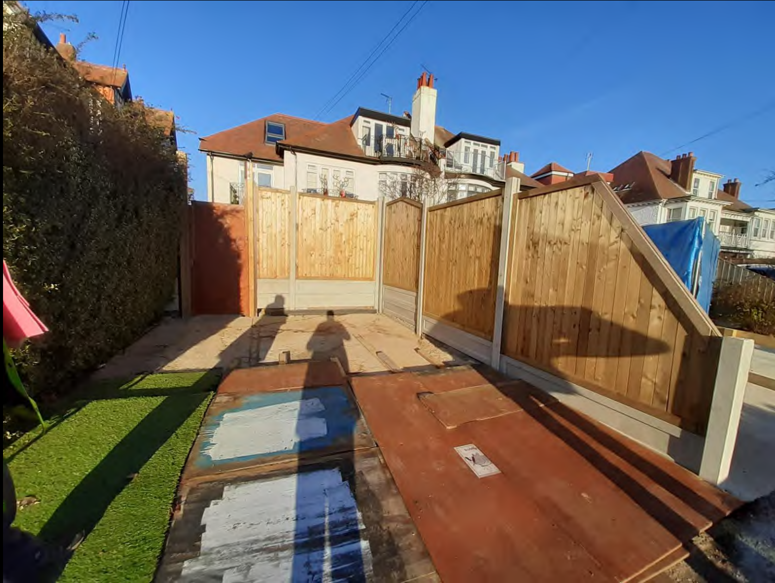
Area to the front of access for the maisonette. Hard standing here is the original surface. Below the fences it is visible by how much the ground was raised.