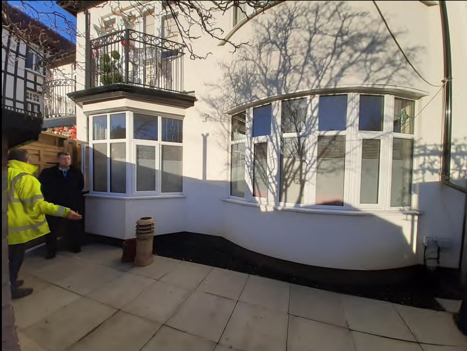
Front part of nursery in enclosed area. Constrc. Manager advised that Early Years department asked for the high fences to prohibit visibility.